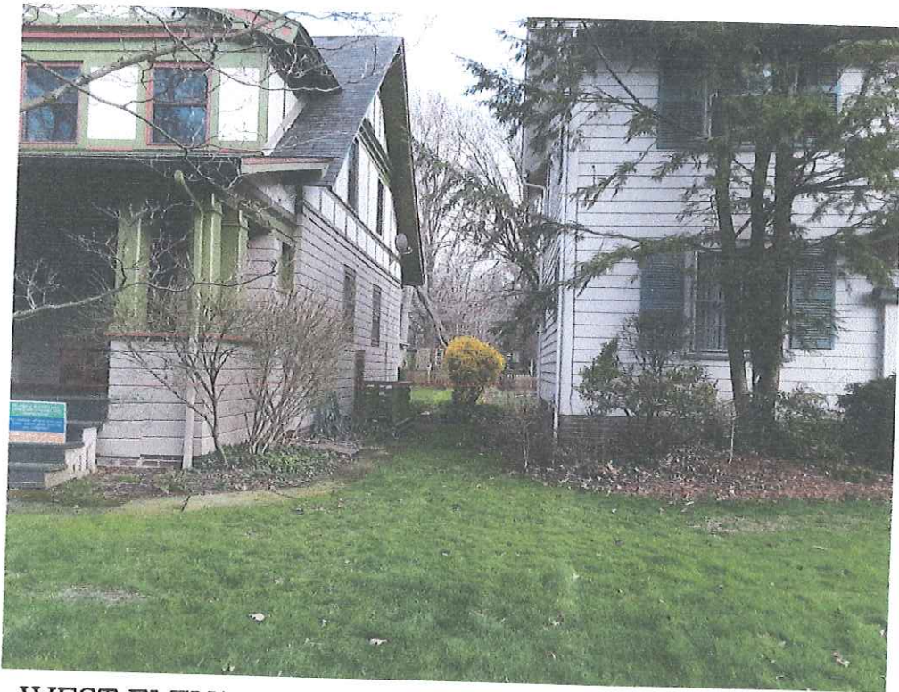
WEST ELEVATION: PROPOSED LOCATION OF NEW GENERATOR WITH DIRECT ACCESS TO GAS METER